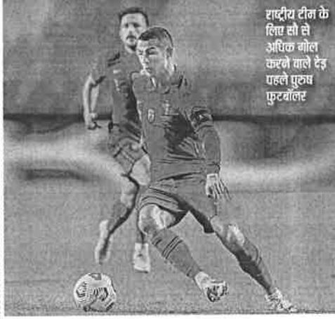
रोनाल्डो, स्ट्राइकर अली के वर्ल्ड रिकार्ड से 7 गोल पीछे रह गए।

बेर्लिन। जर्मनी ने चेक गणराज्य को हराया। जर्मनी ने चेक गणराज्य को हराया। जर्मनी ने चेक गणराज्य को हराया।